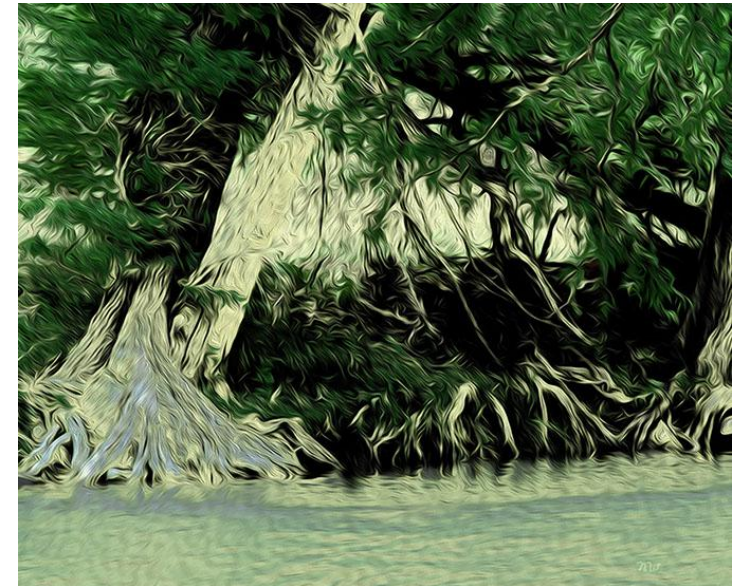
© "Guadalupe River Green Dark" - Nancy Wood